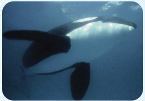
Killer Whale (Orca)