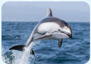
Pacific White-sided Dolphin