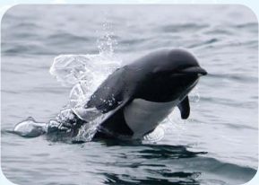
Northern Right Whale Dolphin