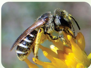
Ligated Furrow Bee