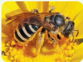
Wide-Striped Sweat Bee