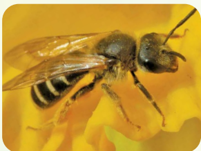
Orange-Legged Furrow Bee