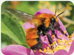
Bumblebee-Like Digger Bee

Anthophora are hairy, medium-size bees that are both specialists and generalists. They tolerate cooler weather than many other bees and can be found earlier in the season.