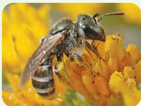
Tripartite Sweat Bee