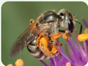
Confusing Furrow Bee

Halictus are small, ground-nesting bees that sometimes have social nests consisting of a few daughters that perform pollen collecting duties. They are grayish-black bees with white bands on the outer edge of each abdominal segment.