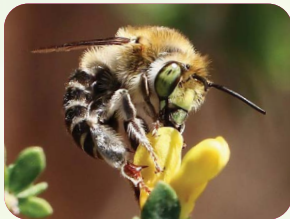
California Digger Bee