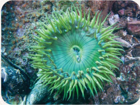
Giant Green Anemone Anthopleura xanthogrammica

Anemones are invertebrates (animals without bones). They have tentacles for stinging their prey (like small crabs and fish), then moving the food to its mouth.