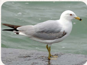
Ring-billed Gull Larus delawarensis