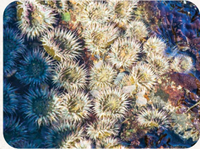
Aggregating Anemone Anthopleura elegantissima