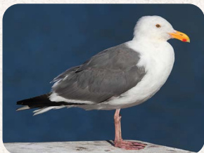
Western Gull Larus occidentalis