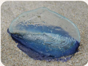
By-the-Wind Sailor Velella velella

While they are beautiful, their tentacles can sting you. Be on the lookout in the water and while exploring the beach. Keep your distance: tentacles can be long or difficult to see.