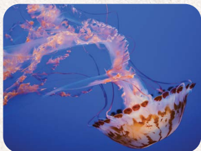
Purple-striped Jelly Chrysaora colorata