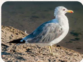
California Gull Larus californicus