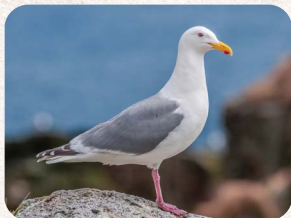
Glaucous-winged Gull Larus glaucescens