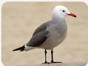
Heermann's Gull Larus heermanni