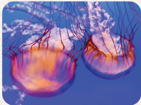
West Coast Sea Nettle Chrysaora fuscescens