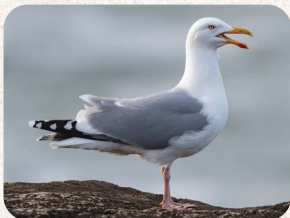
Herring Gull Larus argentatus