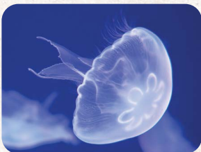
Moon Jelly Aurelia aurita